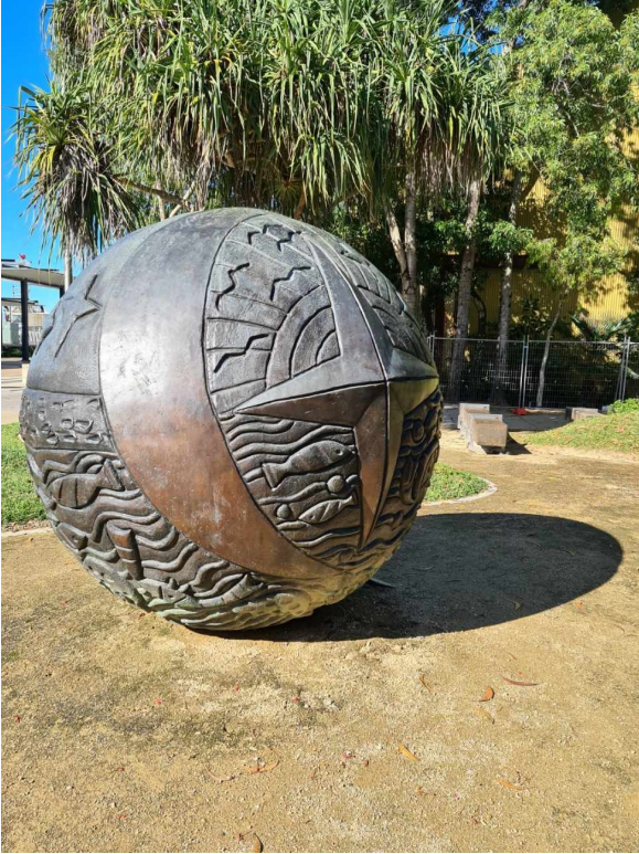
The Lovers' Sphere